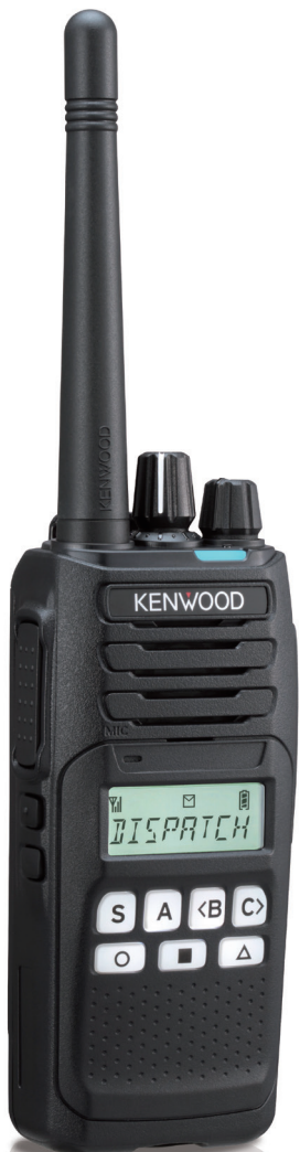
Standard Keypad model

If you are thinking of harnessing the latest digital protocols – NXDN or DMR – to enhance business efficiency or FM analog for its simplicity, the NX-1200/1300 has you covered. Our One-“K”-Fits-All solution offers the widest selection of two-way radios for everyday use. The model matrix also includes basic and keypad variations, with or without a high-contrast backlit LCD. Other features include a 7-color LED indicator and the popular KENWOOD 2-pin audio accessory connector. Plus, mixed-mode operation ensures seamless integration with legacy radios while smoothing the onward migration path to digital. But whatever your specific needs, audio quality is what determines clear voice communications – which is why KENWOOD radios are used under the most grueling conditions, like the cockpit of a racing car. Thanks to our extensive experience with professional systems, reliability is second to none. So whatever your radio requirements, KENWOOD’s NX-1200/1300 offers a single platform that’s right for you.