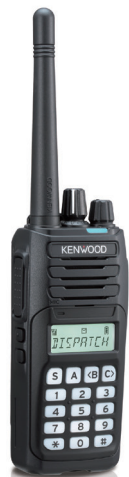
Full Keypad model